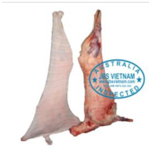
Thịt dê - Goat

2014: Import 947 tons (frozen goat meat), value: 6.547.895 USD. ~ 10% of domestic fresh goat meat.